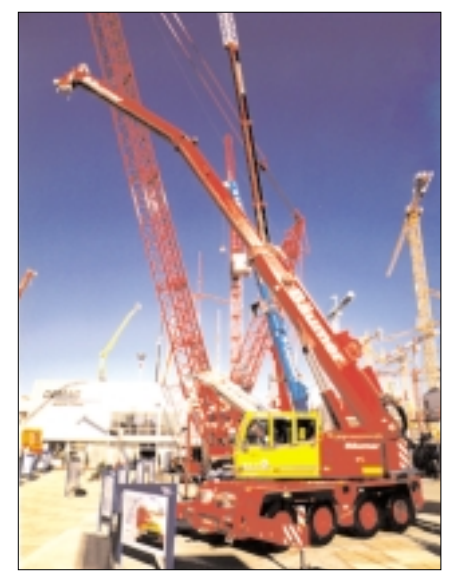
A luffing jib featured on Demag's AC60

"bauma land" is what the local radio station called the outdoor area of bauma and it was a sight/site you'll never forget. "Somewhere between a construction industry Disneyworld and the fantastic dream site of a lunatic civil engineer" is how one visitor described the view to Cranes & Access